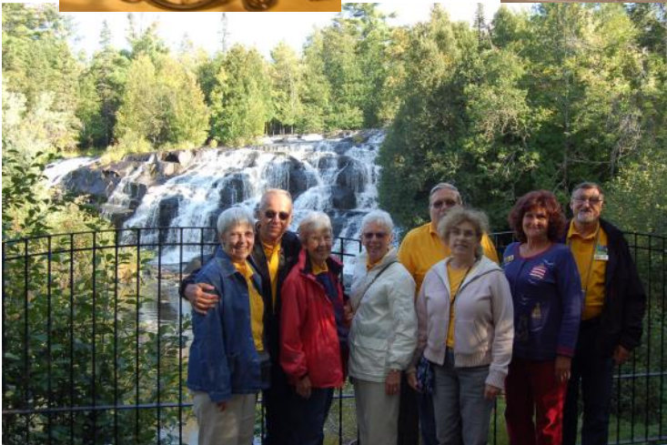
2011 St. Ignace, MI. Fall Tour