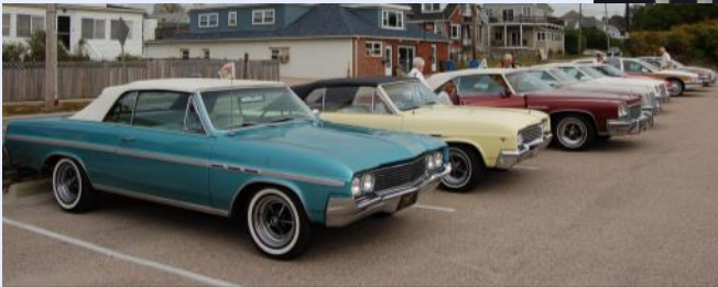
2013 Rhode Island, Fall Tour