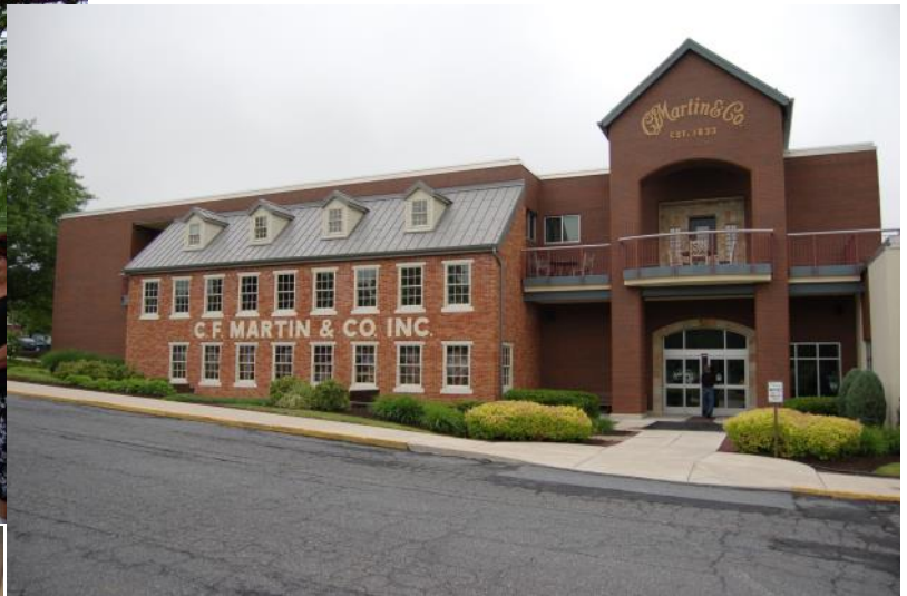
2009 Allentown, PA. National Tour