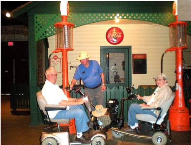
2008 Pensacola, FL. Fall Tour