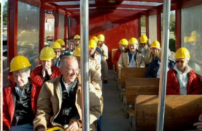
2005 Keweenaw, MI. Fall Tour