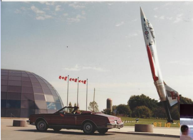
1997, Niagara Falls, Ontario, Fall Tour.