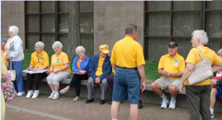
2014 Bryan, OH. Fall Tour