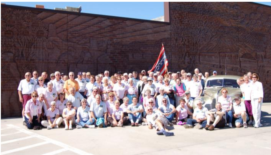
2010 Abilene, KS. Fall Tour