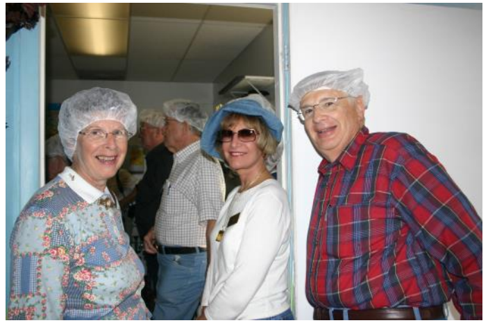
2006 Beaufort, SC. Fall Tour