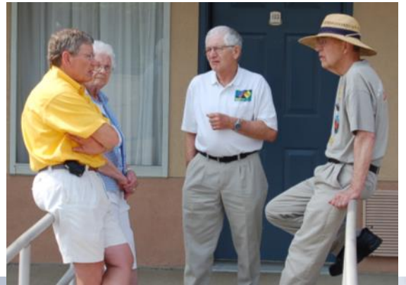
2011 Dayton, OH. National Tour