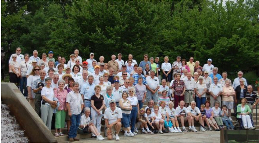
2010 Waynesville, NC. National Tour