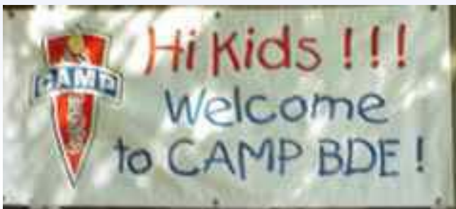
1999 Monteagle, TN. National Tour