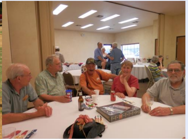
2013 Fredericksburg, TX. National Tour