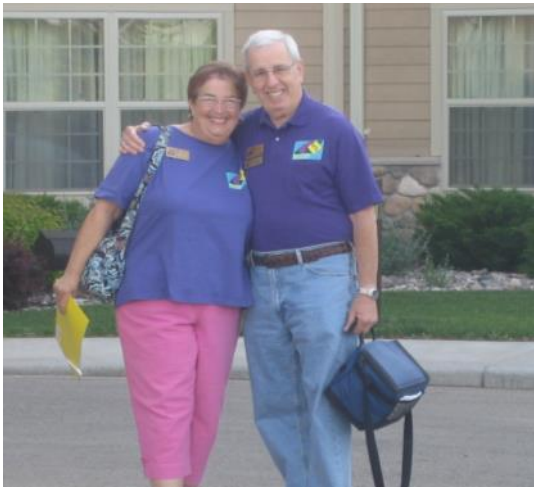
2008 Neenah, WI. National Tour