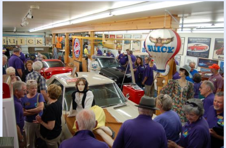
2014 Corning, NY. National Tour