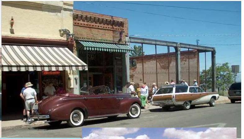
2005 Sedona, AZ . National Tour