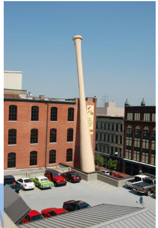
2007 French Lick, IN. National Tour