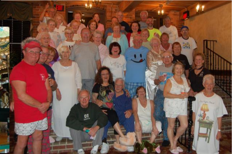
2009 Winston –Salem, NC. Fall Tour