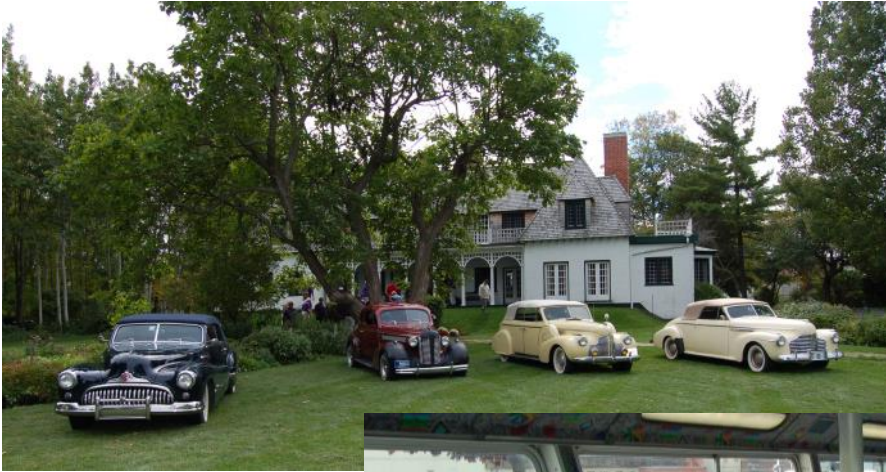
2007 Alliston, Ontario Fall Tour